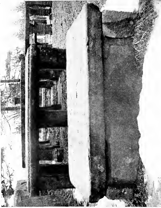
TABLESTONE OF LEONARD CHESTER.